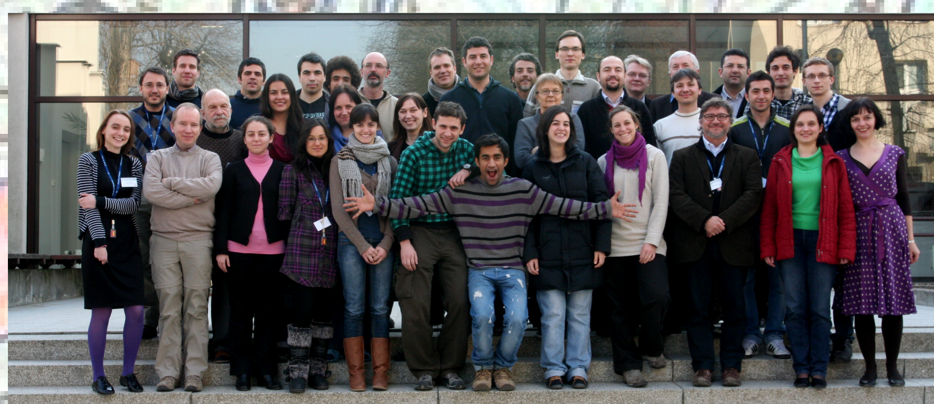
Participants of the international student workshop in 2012

http://www.slcj.uw.edu.pl/student_workshops